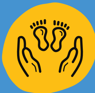
Baby bonding classes such as sensory and massage