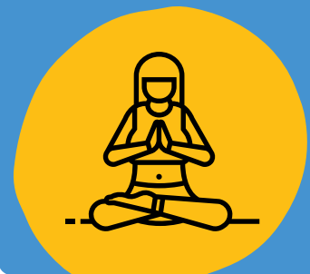
Wellbeing programs such as meditation, art therapy, and coping skills