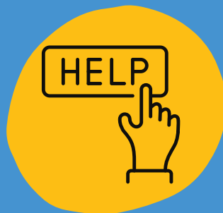
Access to mental health support e.g. peer support/counselling