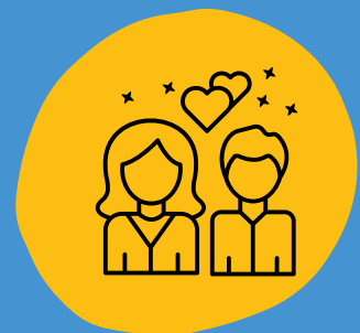
Couples activities to learn to support each other