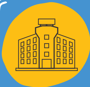
Community space to meet and socialise with other families

Our organisation is led by parents who understand on a deep personal level what the people we support are experiencing. We take a parent-centred and parent-led approach to everything we do, ensuring that all parents who access our service are given the best opportunity to take control over their well-being and no one is left to struggle alone.