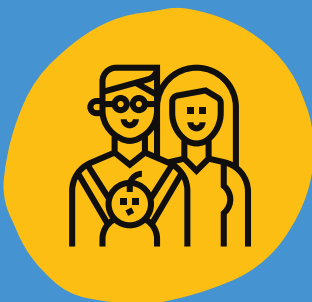
Family activities that promote bonding & family wellbeing